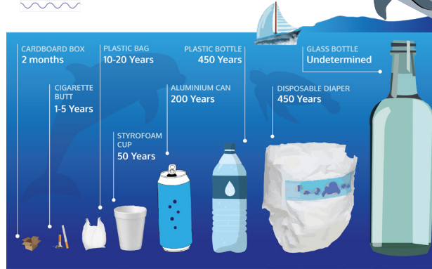
Infographic: Children's work book on Ocean Plastics - Product Lifespan

Estimated decomposition rates of common ocean debris