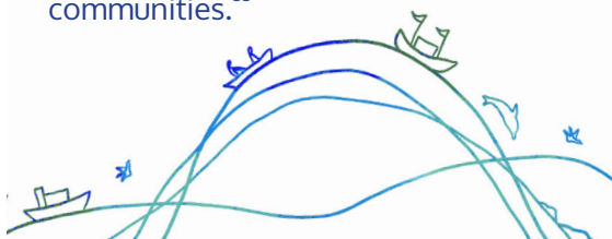
Illustration: Margherita Brunori