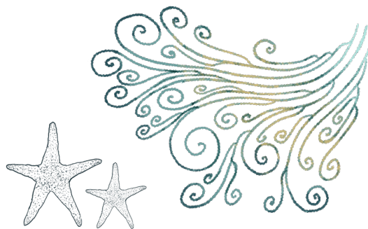
Illustration: Margherita Bruñori