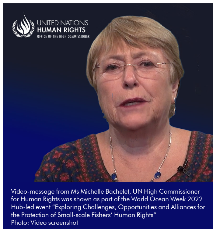
Video-message from Ms Michelle Bachelet, UN High Commissioner for Human Rights was shown as part of the World Ocean Week 2022 Hub-led event "Exploring Challenges, Opportunities and Alliances for the Protection of Small-scale Fishers' Human Rights"

These events shared lessons from our research, the methodologies we've developed, and the relationships we've built. They are some of the ways we have built the capacity of international actors to work with and for SSFs in meaningful ways.