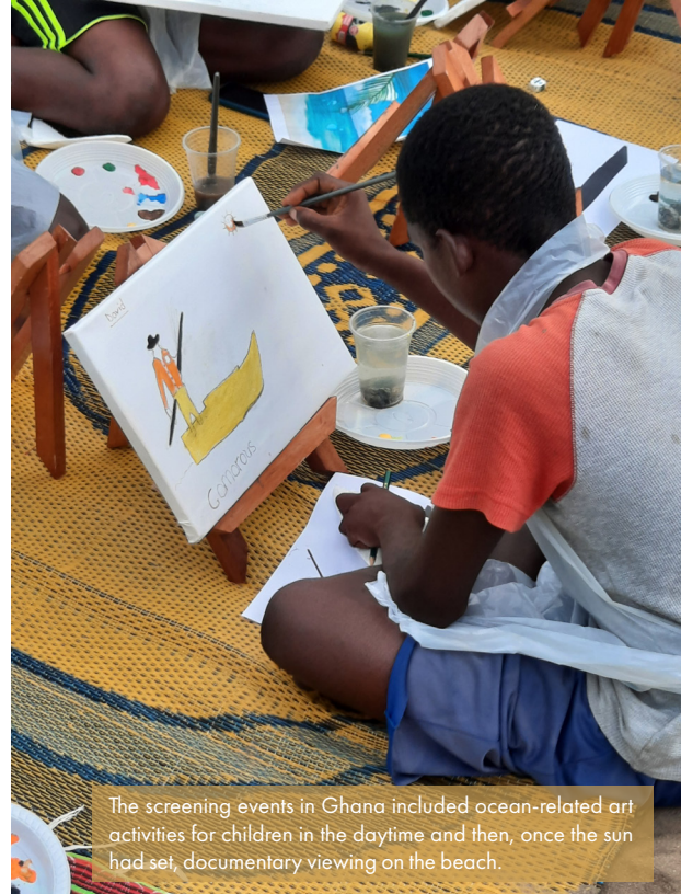
The screening events in Ghana included ocean-related art activities for children in the daytime and then, once the sun had set, documentary viewing on the beach.

fishers composed 43 songs. The result is Nyansapo (Wisdom Knot), a carefully crafted medley of songs reflecting issues such as overfishing, climate change, and pollution. The lyricists have taken the new songs back to their fishing communities which have started to sing them. Together with researchers, they plan to track the spread of these new songs. A follow-up documentary, Cocooned 2.0 , is in production based on this project, and the songs have already travelled internationally as part of a Hub exhibition at the Glasgow Centre for Contemporary Arts .