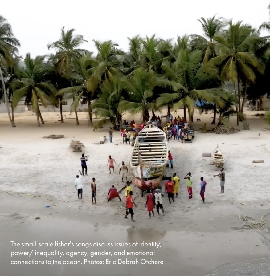
The small-scale fisher's songs discuss issues of identity, power/ inequality, agency, gender, and emotional connections to the ocean.