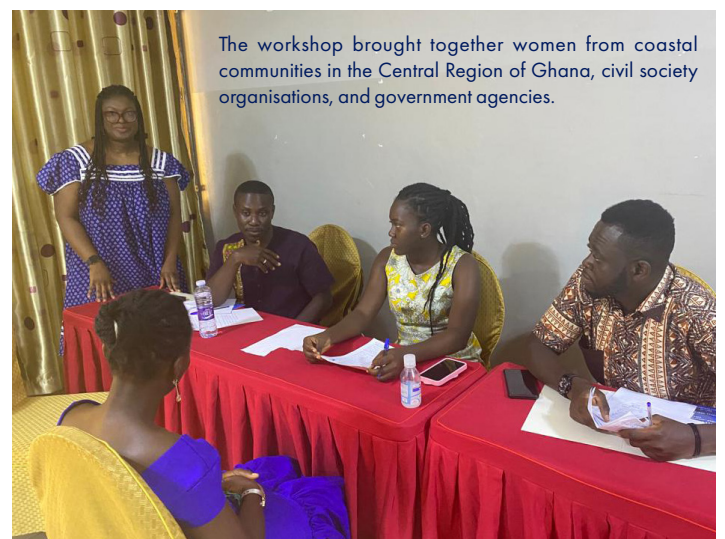
The workshop brought together women from coastal communities in the Central Region of Ghana, civil society organisations, and government agencies.