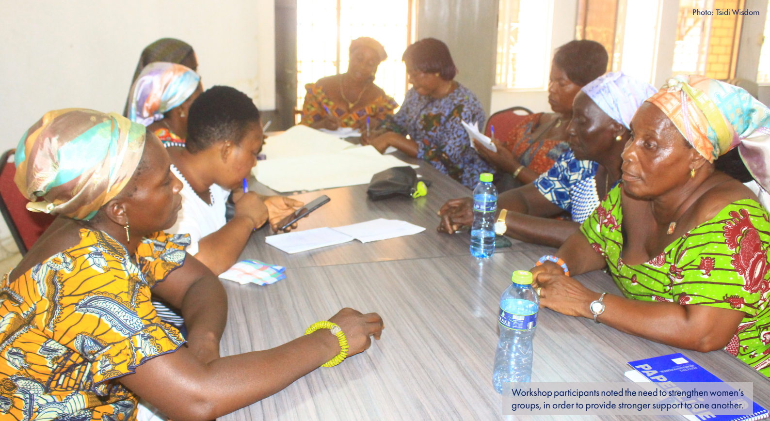
Workshop participants noted the need to strengthen women's groups, in order to provide stronger support to one another.

stronger support to one another and the potential power in acting together to assert their rights, such as refusing to buy bad fish.