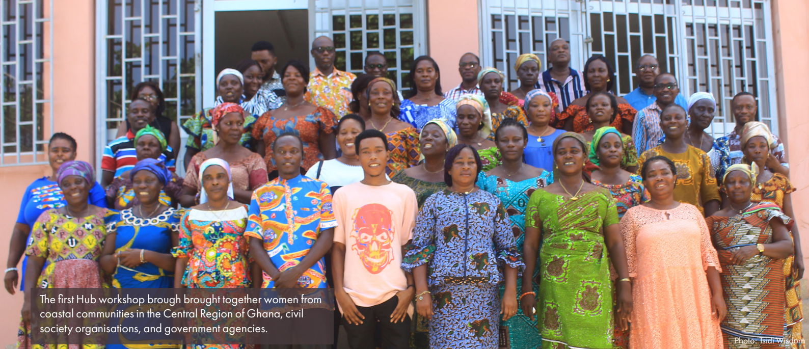
The first Hub workshop brought together women from coastal communities in the Central Region of Ghana, civil society organisations, and government agencies.