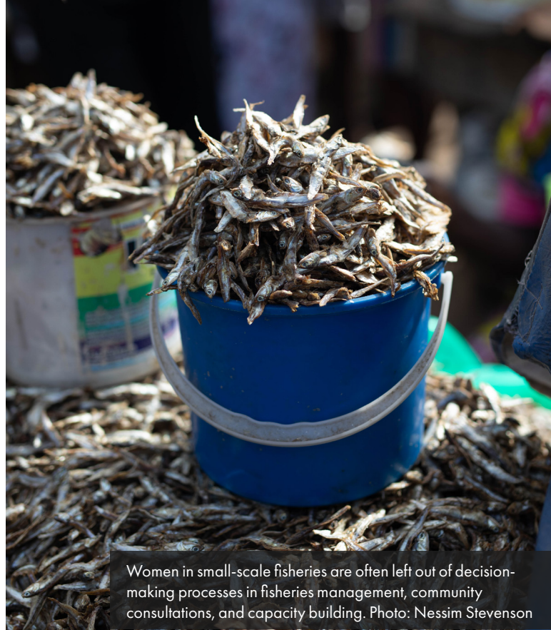
Women in small-scale fisheries are often left out of decision-making processes in fisheries management, community consultations, and capacity building.

I n Ghana, women traditionally occupy the pre- and post-harvest sectors of fisheries, including pre-financing fishing expeditions, processing and distributing fish, and marketing. Despite taking on these significant roles, women in small-scale fisheries (SSFs) are often left out of decision-making processes in fisheries management, community consultations, and capacity-building. Their unique challenges are thus systemically unseen and unaddressed.