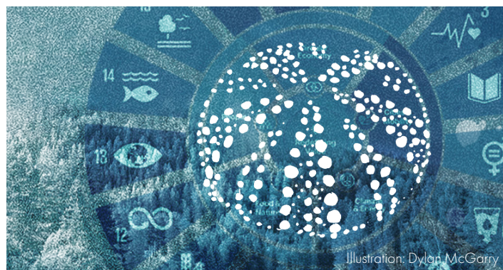
Illustration: Dylan McGarry